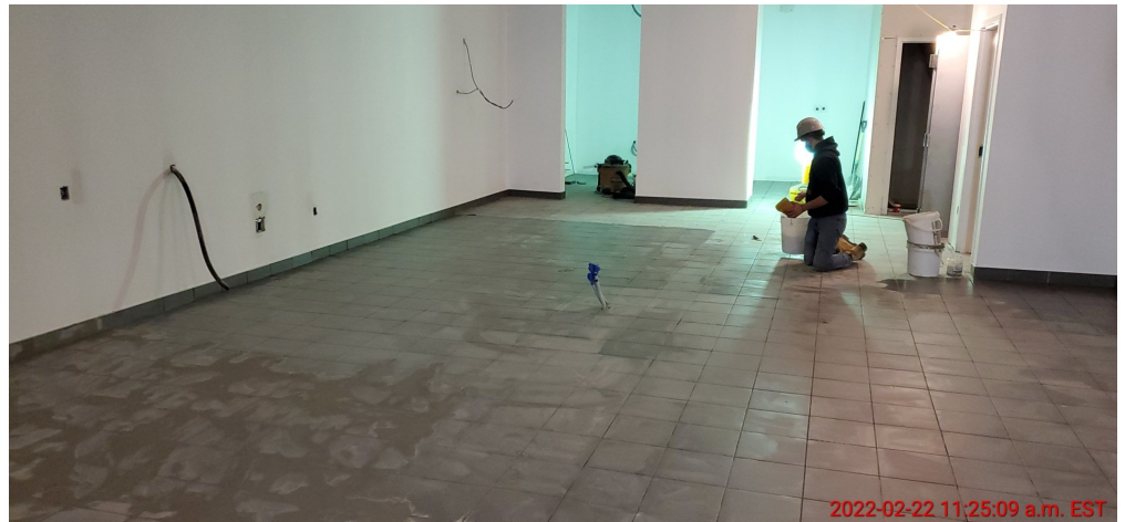
Tile grouting in kitchen and public washrooms.