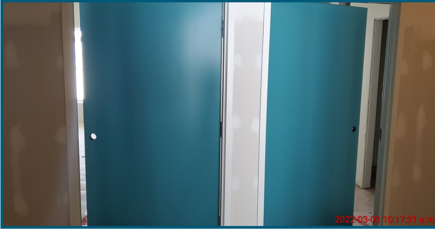
Ground floor painting of resident room doors.