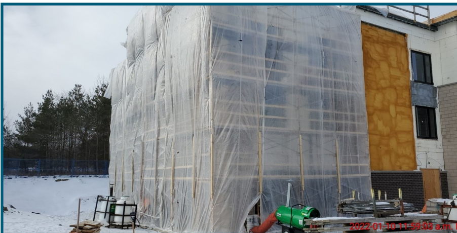
Tarping and scaffolding of exterior façade to continue work during winter conditions.