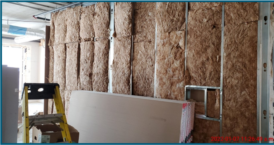
Insulation and drywall underway.