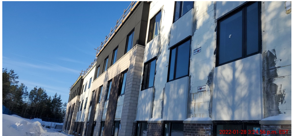
West elevation stucco complete.