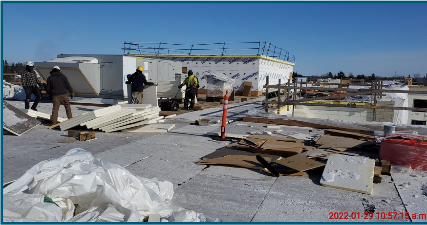
Roof work is ongoing.