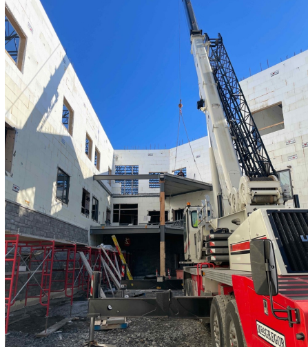
Installing balcony concrete slabs